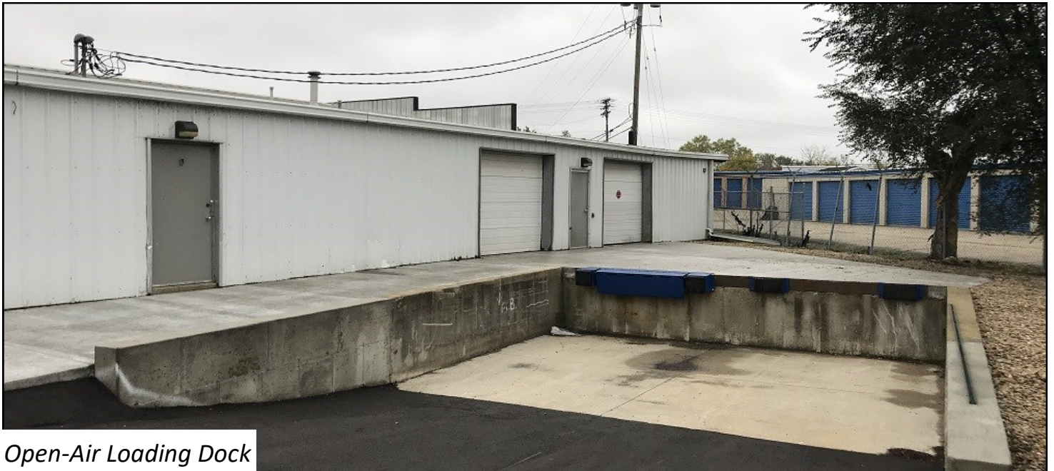
Open-Air Loading Dock