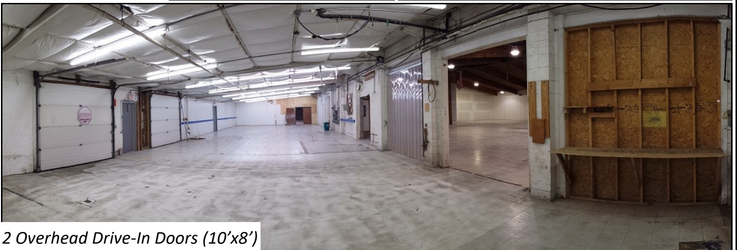
2 Overhead Drive-In Doors (10'x8')