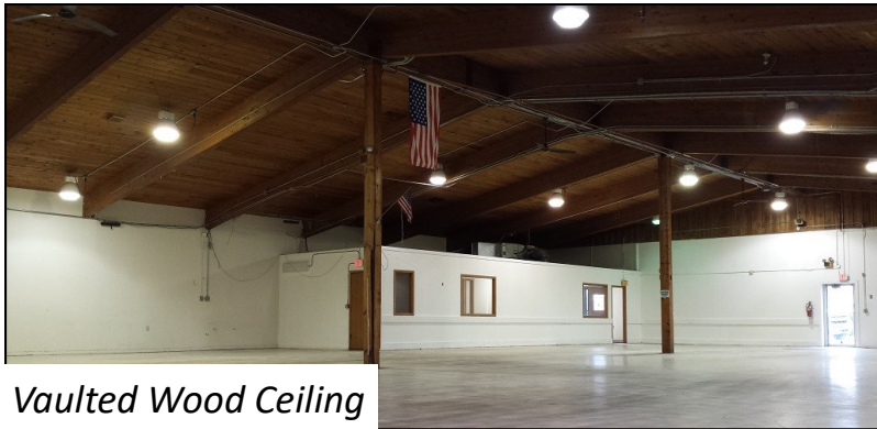
Vaulted Wood Ceiling