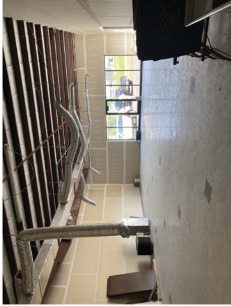
Retail/Showroom area shown above; Landlord is open to white boxing unit pending length of lease term