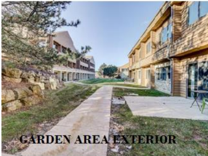
GARDEN AREA EXTERIOR