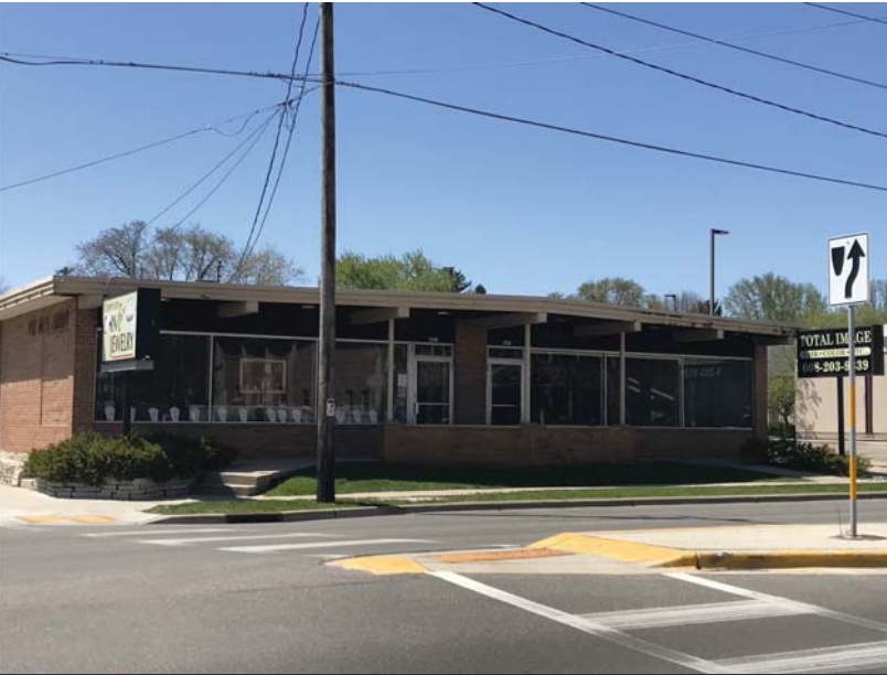
6803 University Ave Middleton, WI 53562