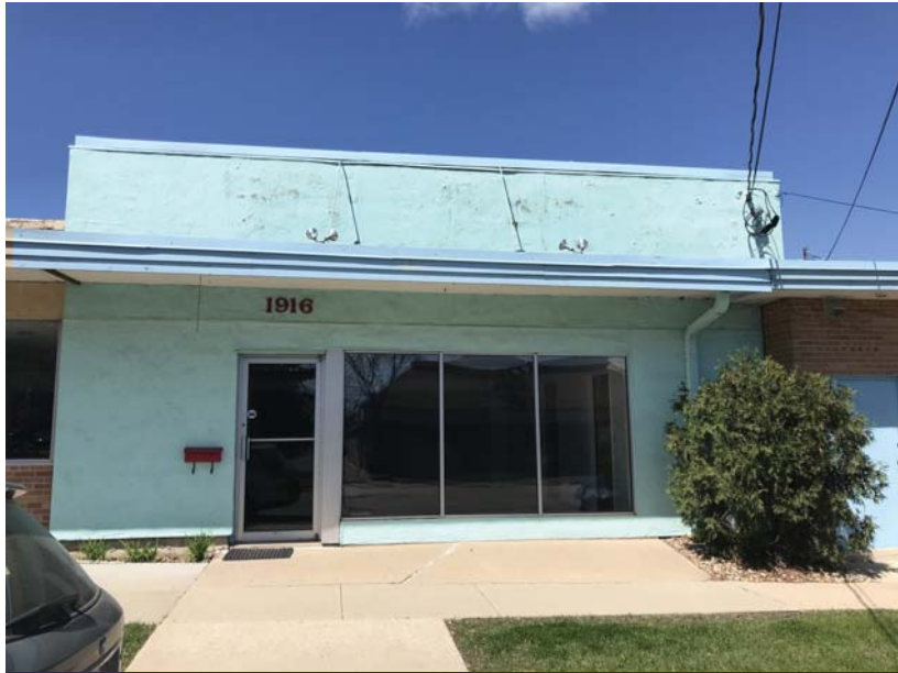
1916/1918 Mayflower Dr Middleton, WI 53562

Recent Price Drop! Now for Sale @ $725,000