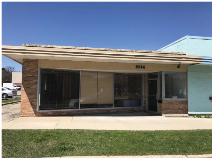
1914 Mayflower Dr Middleton, WI 53562