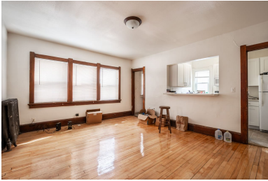
Unit 1 - Kitchen #1