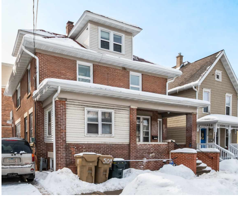
18 S Bassett St