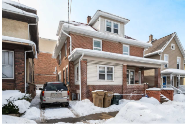
18 S Bassett - Street View