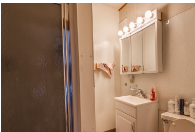
Unit 2 - Full Bathroom #1