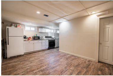
Unit 1 - Kitchen #2