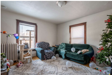
Unit 2 - Living Area