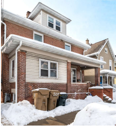
18 S Bassett St