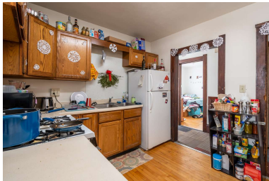
Unit 2 - Kitchen