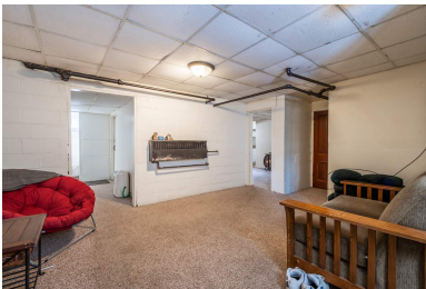
Unit 1 - Living Area #2