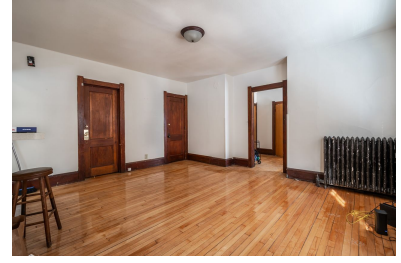
Unit 1 Living Area #1