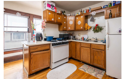
Unit 2 - Kitchen