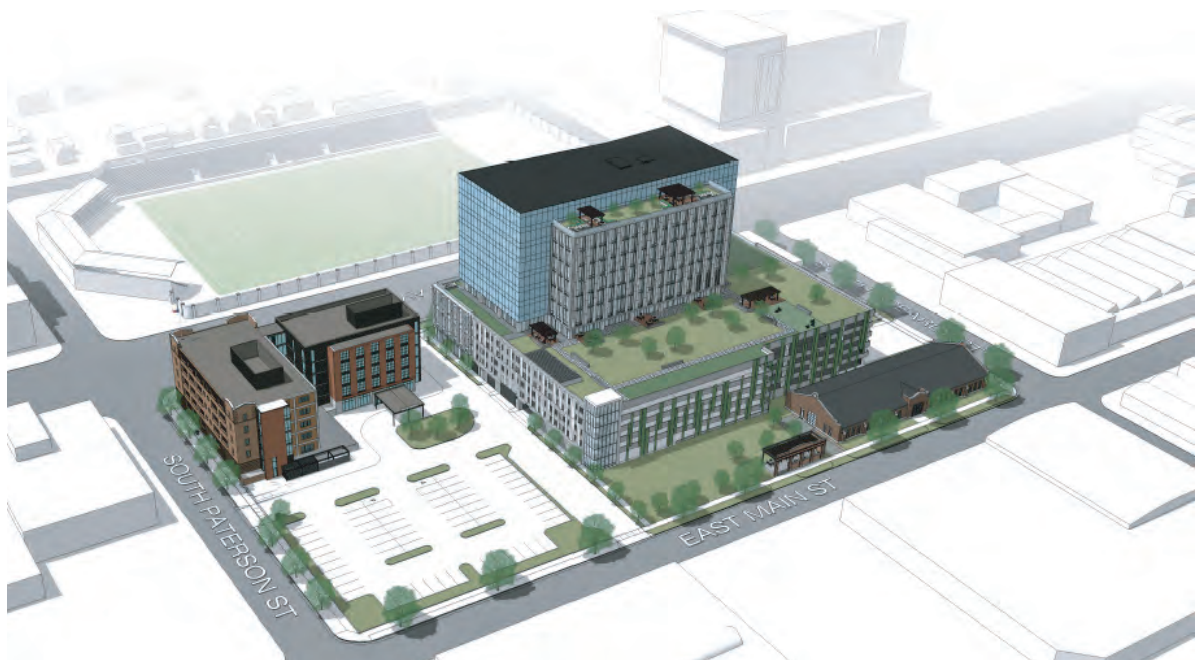
From South-West, looking North-East (below)