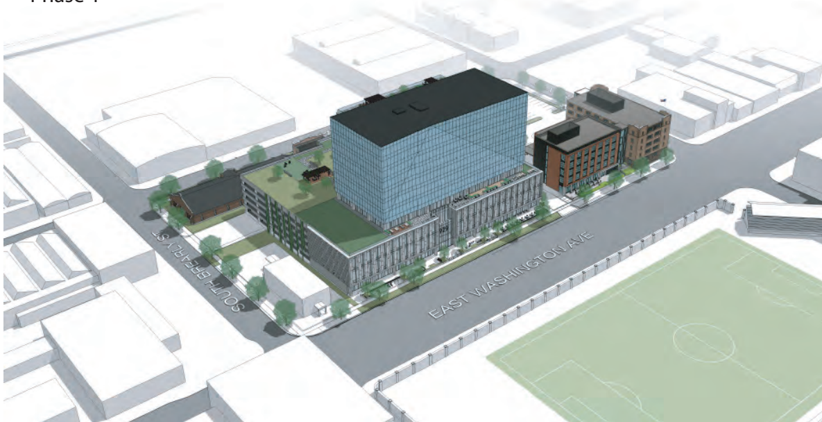
From North-East, looking South-West (above)