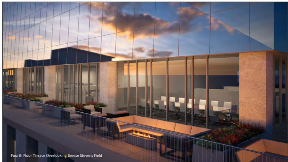
Fourth Floor Terrace Overlooking Breese Stevens Field