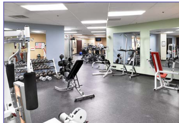
On-Site No-Fee Fitness Center