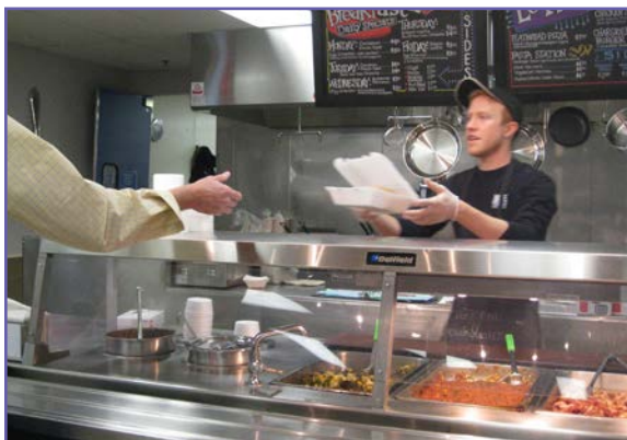
On-Site Full Service Cafe, Serving Breakfast & Lunch