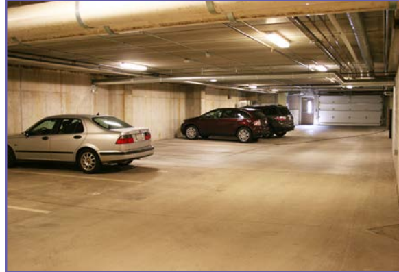
On-Site Secured Heated Underground Parking