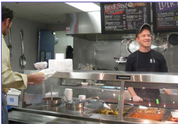
Full Service Cafe at 8401 Greenway