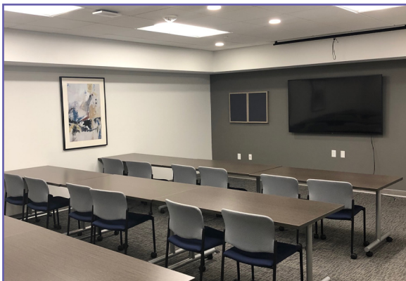
On-Site Board Room