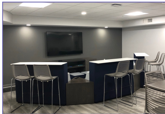
On-Site Gaming Lounge