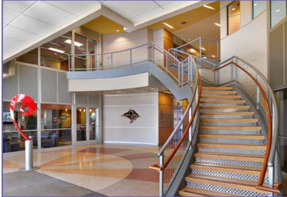
Two-Story Open Lobby