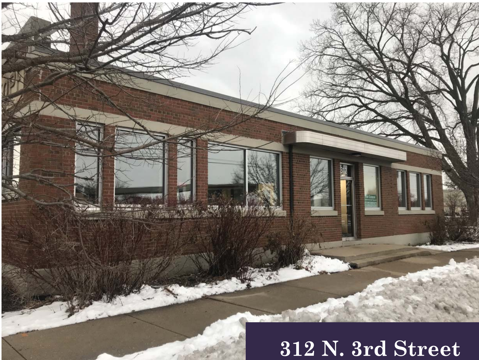
Building Entry from 3rd Street