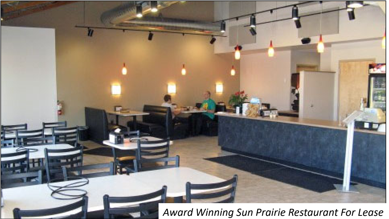
Award Winning Sun Prairie Restaurant For Lease