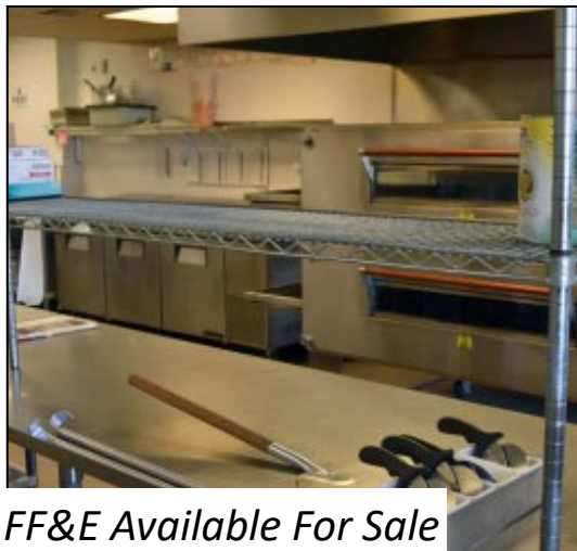
FF&E Available For Sale