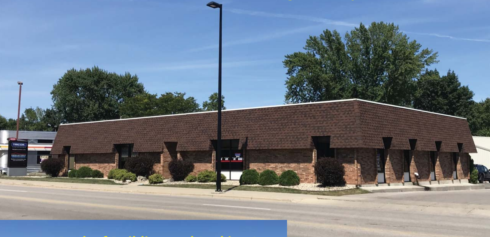
Back of Building and Parking Lot