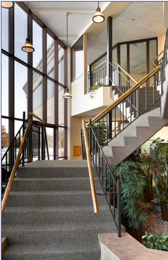
2 Story Atrium Entrance