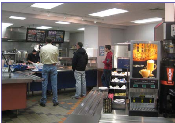
Full-Service Cafe at 8401 Greenway Blvd.