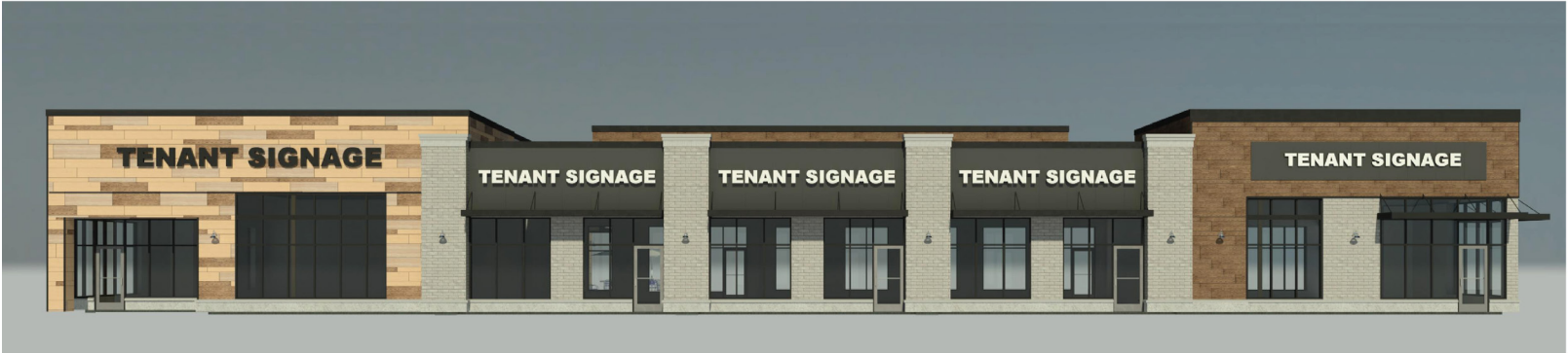
City approved conceptual rendering and site plan