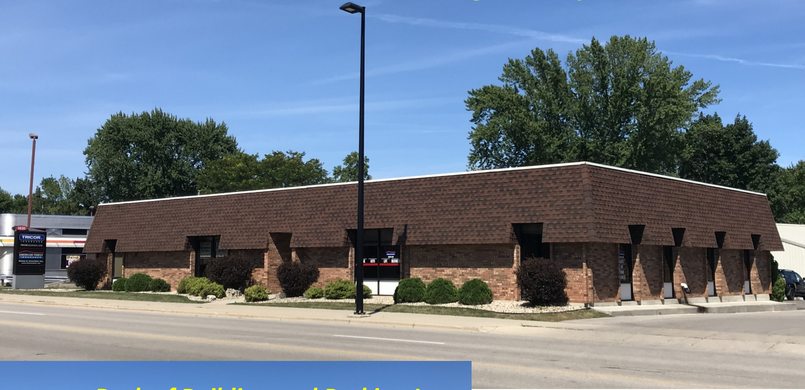
Back of Building and Parking Lot