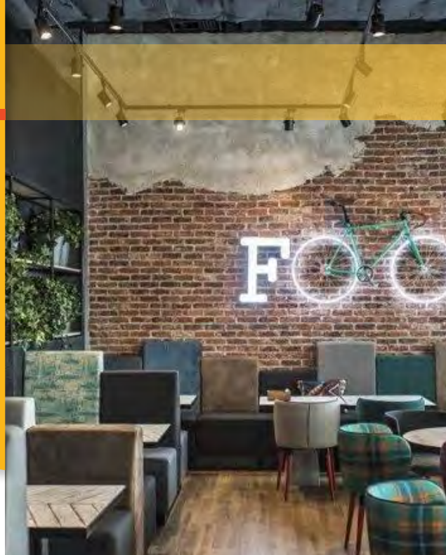
RESTAURANT | COFFEE